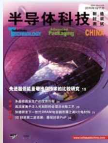
中文简体版 Simplified Chinese Edition