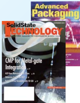
英文版 English Edition