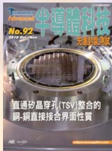
中文繁体版 Traditional Chinese Edition