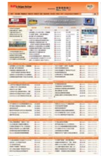
网上论坛 Online Forum www.mychipchina.com